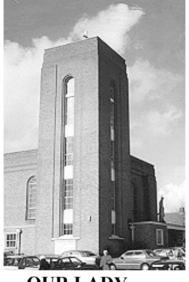
OUR LADY, OUEEN OF APOSTLES